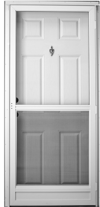
self-storing storm shown