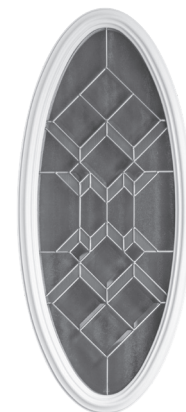
3/4 Oval Window Shown