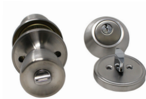
0295126 Adjustable Entrance Combo Lock - Stainless Steel