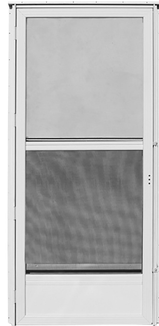
Self-Storing Storm Shown