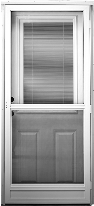
Self-Storing Storm Shown