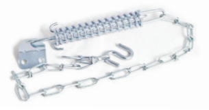
0210601 Safety Chain Kit for Exterior Door