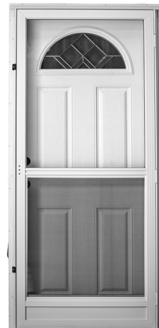
Self-Storing Storm Shown