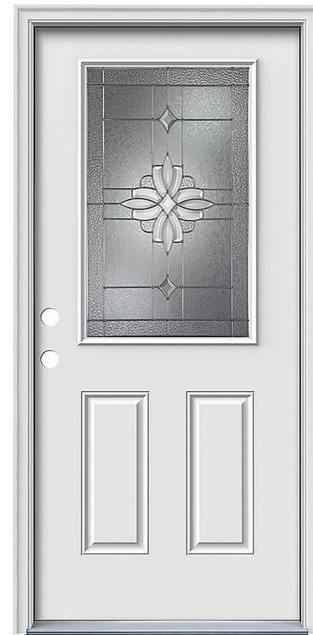
Full View Storm Shown