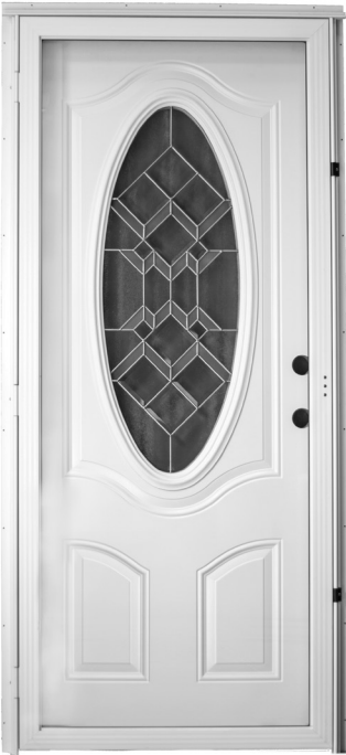
Full View Storm Shown