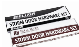
0212038 Hardware Kit for Storm Door - White