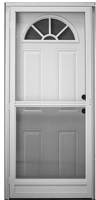
Self-Storing Storm Shown