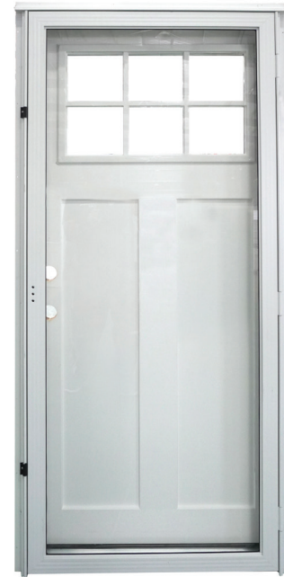
Full View Storm Shown