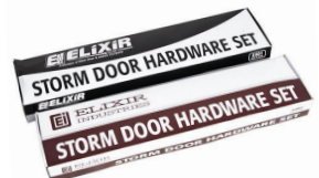
0212036 Hardware Kit for Storm Door - Black