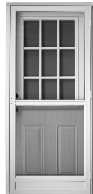
Self-Storing Storm Shown