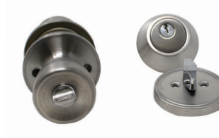
0295127 Combo Lock Set Master Keyed - Stainless Steel

LIFESTYLE OUTSWING DOORS are made with high strength steel and quality workmanship. They have a polyethylene filling, 0.5mm steel skin with PVC film and are white.