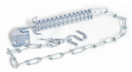
0210601 Safety Chain Kit for Exterior Door