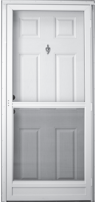
Self-Storing Storm Shown