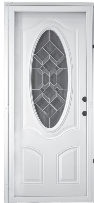
Full View Storm Shown