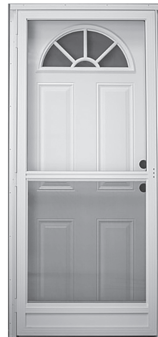
Self-Storing Storm Shown