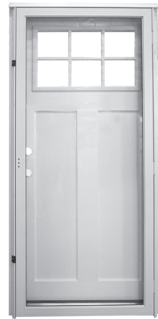
Full View Storm Shown