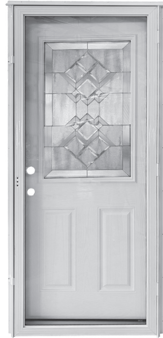
Full View Storm Shown