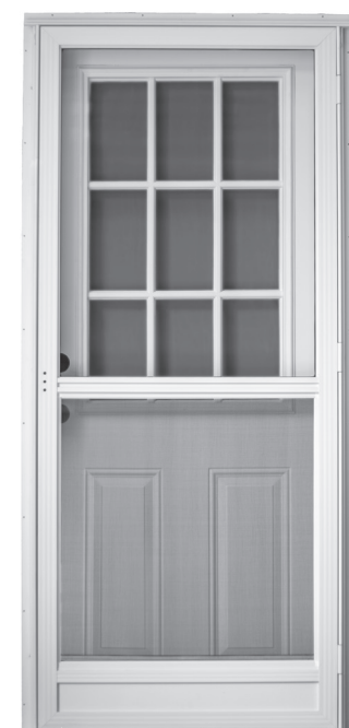
Self-Storing Storm Shown