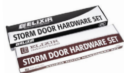
0212036 Hardware Kit for Storm Door - Black