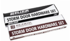
0212038 Hardware Kit for Storm Door - White