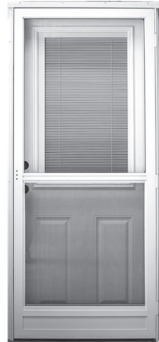
Self-Storing Storm Shown