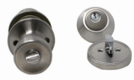
0295127 Combo Lock Set Master Keyed - Stainless Steel