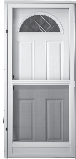
Self-Storing Storm Shown